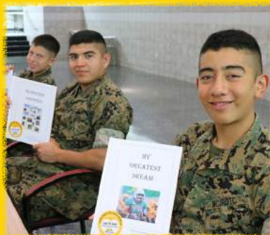
ESL students show their literary works during the recent book viewing at MMA's Cadet Activity Center.