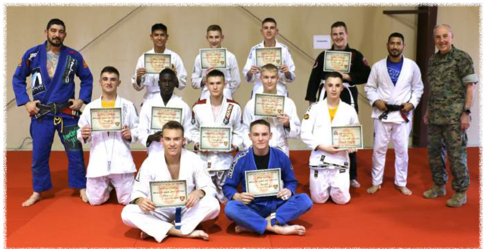
Members of MMA's Jiu Jitsu Team receive certificates during the promotion ceremony April 11.