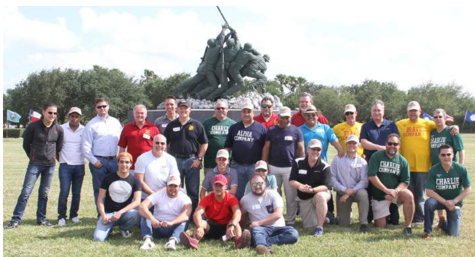
Marine Military Academy alumni returned to Harlingen for the yearly reunion.