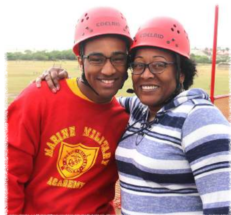
MMA cadets and their families enjoyed a morning of zip-lining and rappelling during the recent Spring Fling. The annual event is organized by the Marine Military Academy Parents Organization.