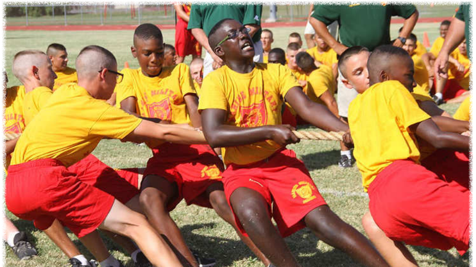
Platoon 101 gives 100 percent during Tug of War.