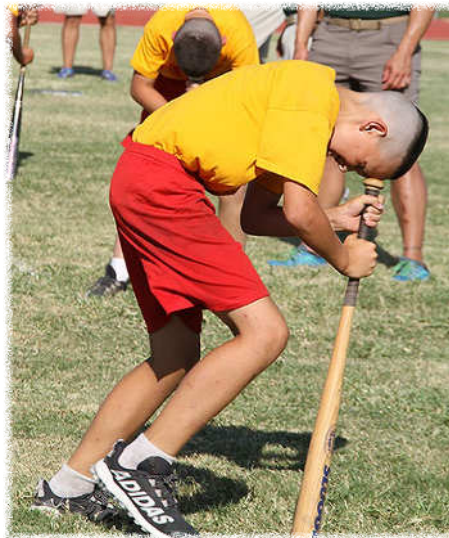
A summer camper spins around the bat during Dizzy Izzy.