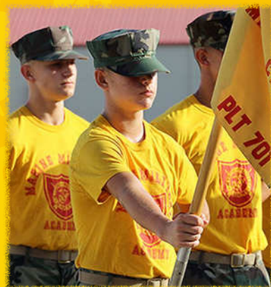
Platoon 701 gets ready to execute drill commands.