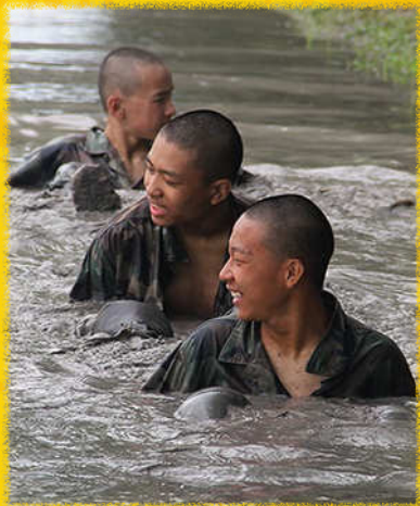
The boys of Charlie Company (ESL) cool down with a mud dip.