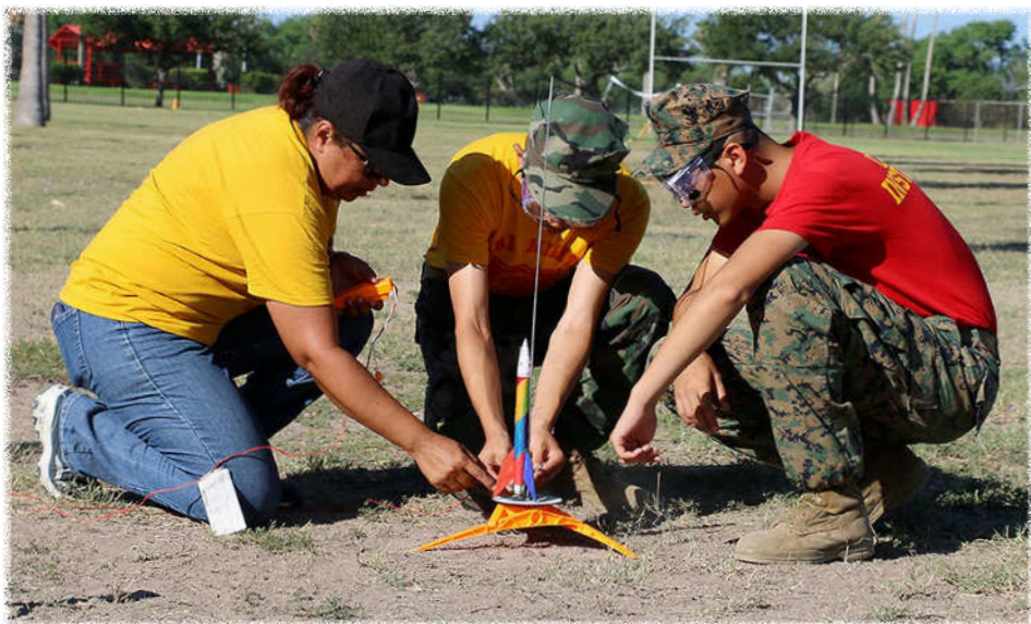
An ESL camper prepares to launch his rocket with help from his teacher and cadet instructor.