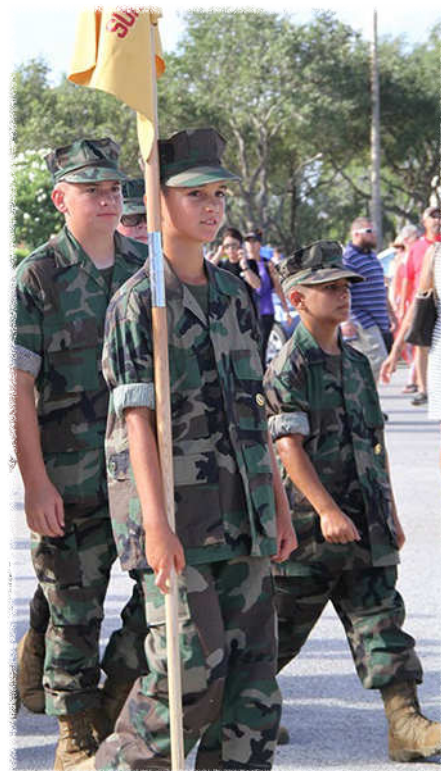
Platoon 1001 marches onto Battalion Avenue for the graduation ceremony.

This year, MMA's campers originated from nine countries and 33 states.